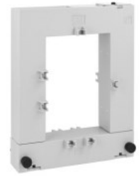
Current transformers DM3TA1500